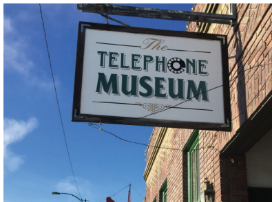
Pacific Telephone and Telegraph Co.

nkc museums.wordpress.com/telephone-museum/