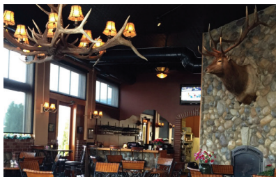
Beau's Pizza, Pasta & Steak

Traditional Mexican dishes, artisan margaritas and a wide range of domestic and imported brews.