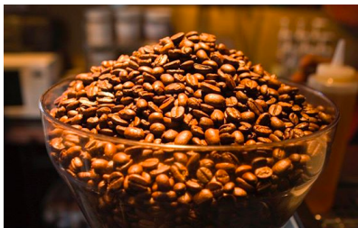
Pioneer Coffee Roasting Co.

Here in Cle Elum we value well-prepared dishes and craft beverages. Downtown Cle Elum offers a variety of restaurants, specialty food shops, coffee bars and late night pubs within a mile radius. Many food options in Cle Elum are sourced from local ranchers and artisan bakers; with dishes available for every type of eater. For a night out on the town discover the pubs' rotating beer taps and tasty happy hour specials.