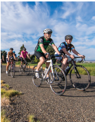
Bicyclists in Kittitas County