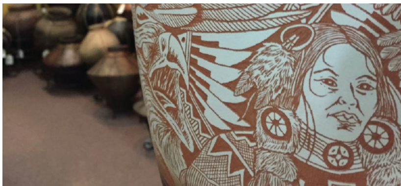
Mac-A-Bee Southwestern Gifts

Find everything you'll need for fly fishing here.