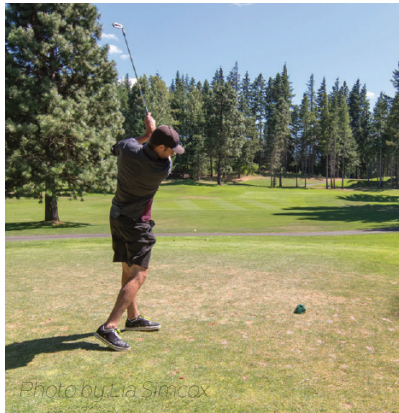
Sun Country Golf Course

Events, clinics and facility information available at: wahorsepark.org