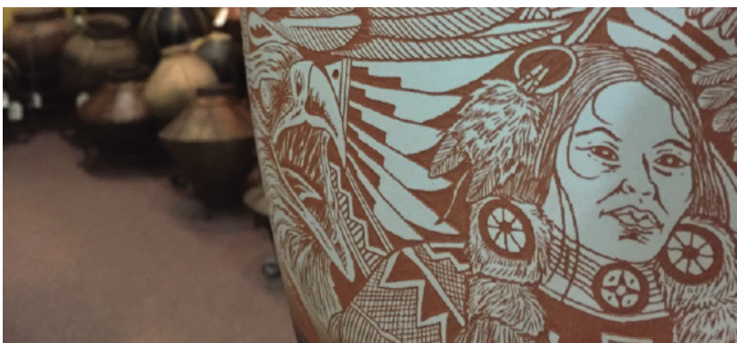
Mac-A-Bee Southwestern Gifts

Find everything you'll need for fly fishing here.