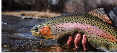
Troutwater Guided Fly Fishing

Travel off the pavement to a hiking trail for some fresh air and breathtaking scenery. Stop by some of our wonderful museums or visit one of our quirky local attractions on your Cle Elum excursion. Cle Elum is your playground in the mountains.