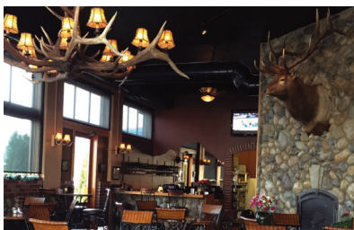
Beau's Pizza, Pasta & Steak

Traditional Mexican dishes, artisan margaritas and a wide range of domestic and imported brews.