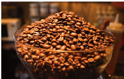
Pioneer Coffee Roasting Co.

Here in Cle Elum we value well-prepared dishes and craft beverages. Downtown Cle Elum offers a variety of restaurants, specialty food shops, coffee bars and late night pubs within a mile radius. Many food options in Cle Elum are sourced from local ranchers and artisan bakers; with dishes available for every type of eater. For a night out on the town discover the pubs' rotating beer taps and tasty happy hour specials.