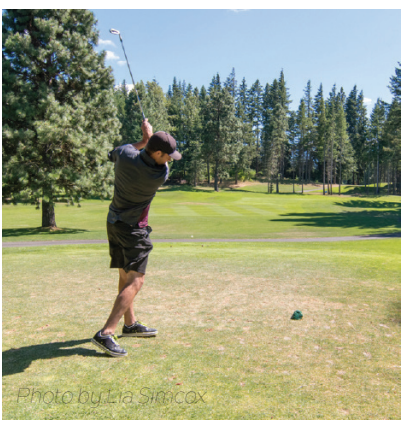
Sun Country Golf Course

1202 Douglas Munro Blvd. Events, clinics and facility information available at: www.washingtonstatehorsepark.com