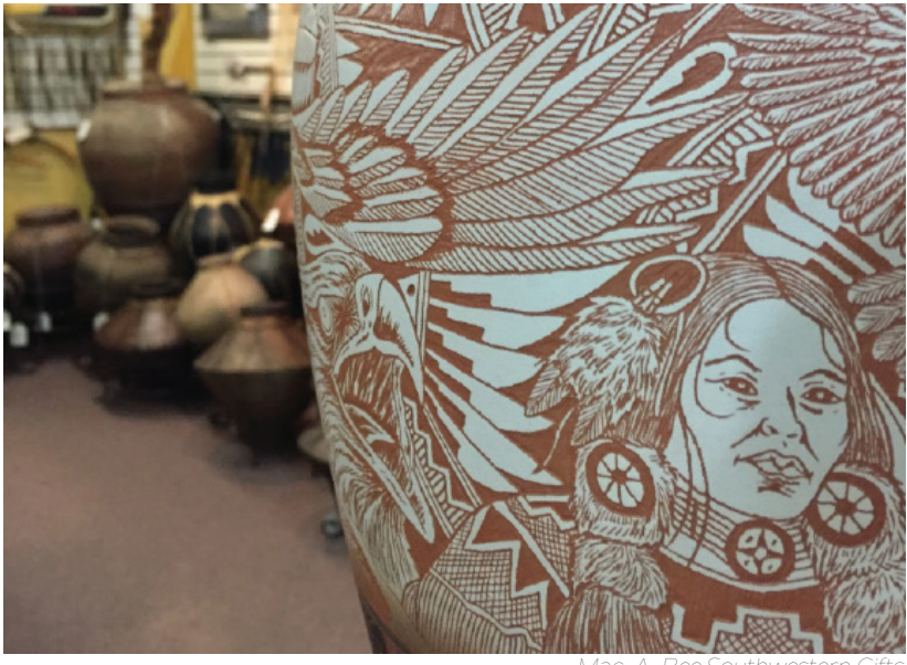
Mac-A-Bee Southwestern Gifts

Home décor, fashion accessories and high-end gifts for young and old, just steps away from the Fireside Lounge.