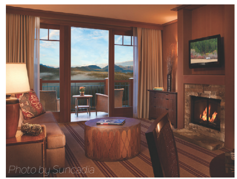
The Lodge at Suncadia

After a weekend of hiking, biking, snowmobiling and visiting with friends, Cle Elum's downtown lodging facilities will feel like coming home. Classy comfort, a little bit of quirky relaxation, and a lot of good hospitality awaits every special visitor in this beautiful town. Cle Elum has what every traveler needs at the end of an adventure filled day.