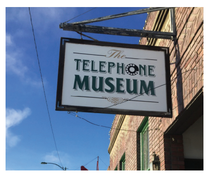
Pacific Telelphone and Telegraph Co.

The oldest complete telephone museum west of the Mississippi, including mining artifacts and bank memorabilia.